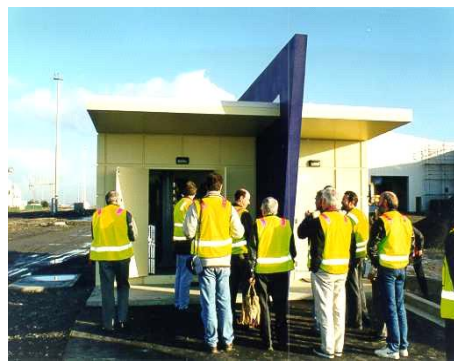
Figure 1: Level Crossing Installation

It is preferable that all diagrams, graphs and photographs be embedded within the document. The preferred method of inserting a photograph is to insert the image as a JPEG file. The label for figures should be Arial Narrow 11 point italic